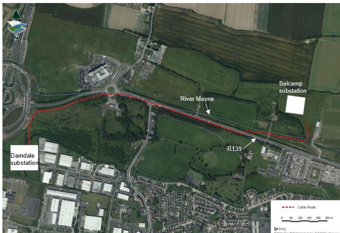
Figure 2.1 Proposed Route of 110kV Underground cable installation

The design of the underground cable will comprise a double 110kV circuit installed underground in HDPE ducting. The 110kV cables will be a standard XLPE (cross-linked polyethylene) copper cable. XLPE does not contain oil, therefore there is no risk of migration of oil into ground in the event of a failure.